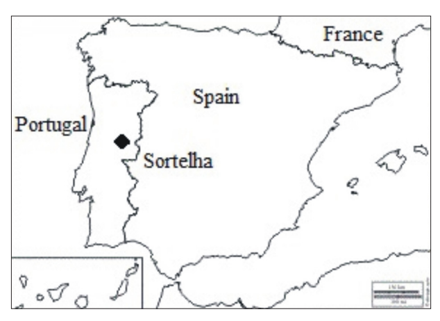
Fig. 1: Location of the case study area

Programme for the Historic Villages of Portugal (1995–2006), a state-led programme aiming to renovate the historic buildings and the built environment and to generate tourism revenue for the populations of 12 villages in the eastern side of the Central region of the country.