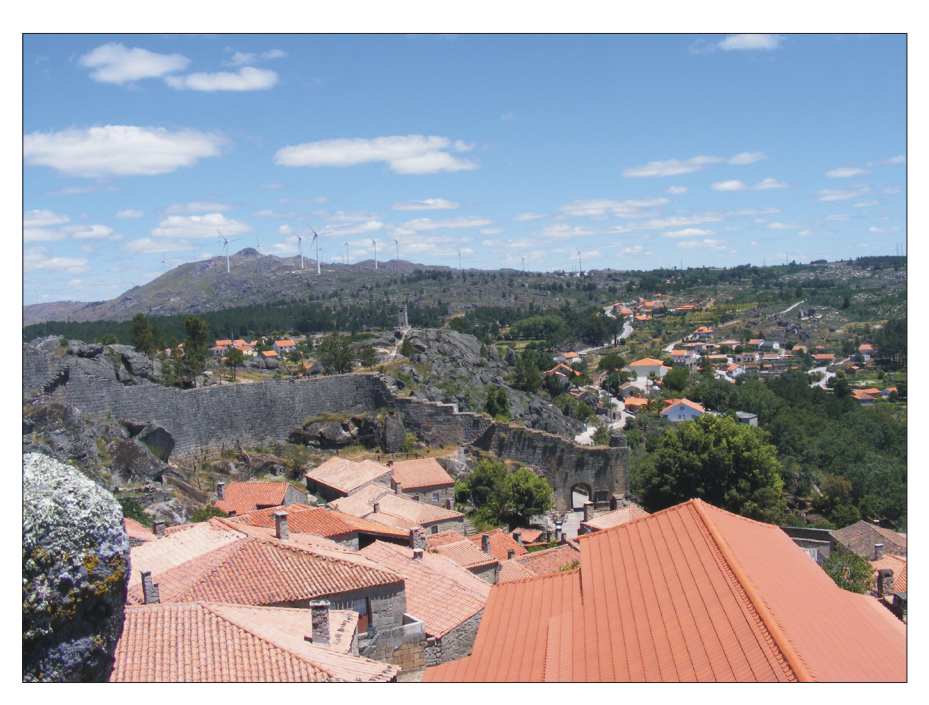
Fig. 2: The wind farm of São Cornélio viewed from the citadel of Sortelha.

In 2010–2011, Sortelha witnessed the construction of two wind farms close to the village, the wind farm of São Cornélio (39.1 MW) and the wind farm of Troviscal (18.4 MW). Situated about two kilometres from the citadel of Sortelha, the wind farm of São Cornélio (with 17 wind turbines, 85 metres height) was licensed with a favourable conditional EIA, which required only the monitoring plans for noise and mortality of birds and bats, and small restrictions on the construction (see Fig. 2). There was no landscape or visual impact assessment, even though, according to the Portuguese law of cultural heritage, it is illegal to change