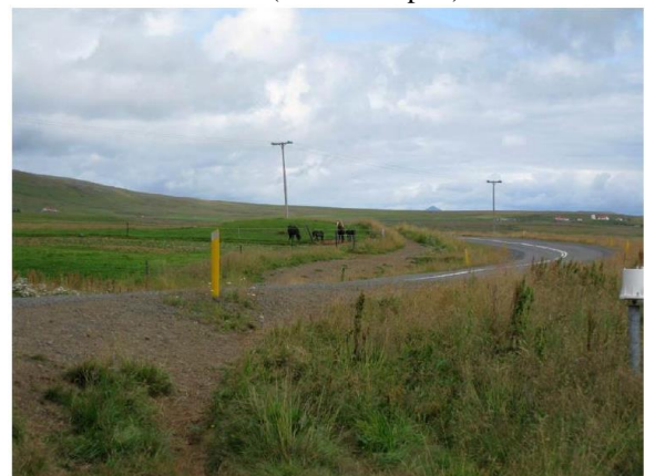
Figure 31c Álagaþleitur (FI) at the gate of Sturly-Reykir farm. Proposals for straightening the road were not implemented due to tales about “hidden people”, passed on through the generations, living on the area which would be affected.