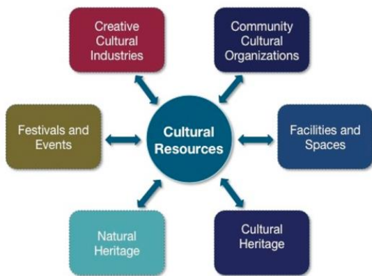
Figure 31a Categories of the cultural resources.

Cultural diversity, Cultural landscape mapping, Cultural resource mapping, GIS, participation