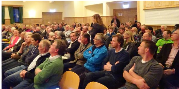
Figure 41b Often public participation is restricted to one/several public presentation of plans. Public hearing in Heiligenblut (Austria) during the World Heritage nomination process of the Großglockner High Alpine road.