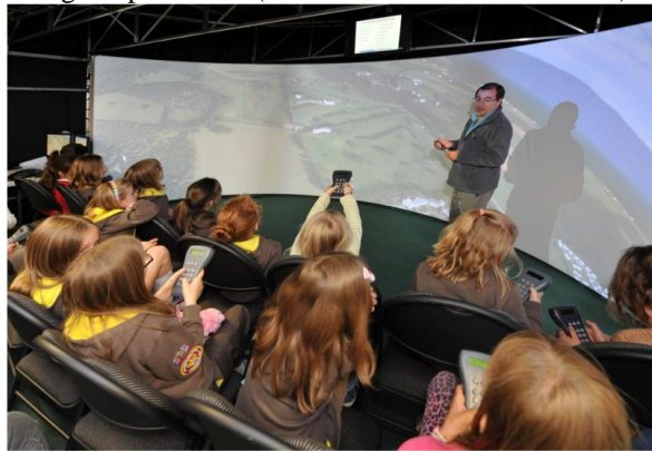
Young people voting on benefits associated with different land uses in Aboyne, Aberdeenshire