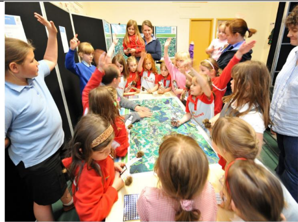
Identifying benefits from the land, annotating aerial photographs, Aboyne, June